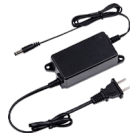
PFM320 12V 2A Power Adapter